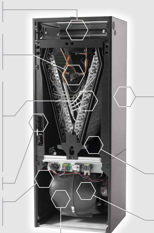
Features and components applicable to Hyperion TAM8 Series only, may vary by model and are shown for illustration purposes only.

➤ Unique Cabinet Design built with tough, double-wall construction and enclosed foam insulation virtually eliminates sweating and condensation. Less moisture and fewer dust particles are drawn in from garages, attics or crawl spaces, helping improve indoor air quality. The cabinet interior is also easy to clean.